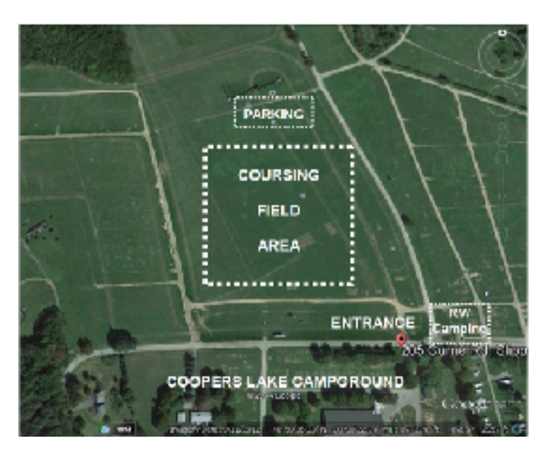
There will be yellow ASFA coursing signs from PA 422.